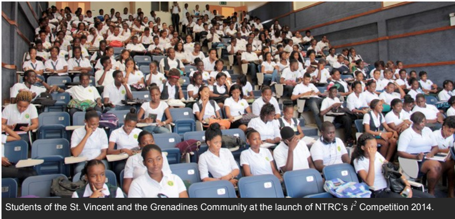
Students of the St. Vincent and the Grenadines Community at the launch of NTRC's i^2 Competition 2014.